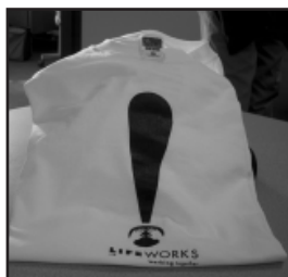
Tees - $10

Need some new gear for spring? Then why not pick up some great SCE LifeWorks merchandise! You'll not only look stylish, you will be supporting SCE LifeWorks at the same time. Currently in stock we have black ball caps with our name on the back, our exclamation T's (available in small, medium, large & x-large) and our new copper travel mugs. To purchase any of these great items, simply stop by the SCE LifeWorks office, or call Susan at 775-9402.