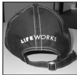
Caps - $10