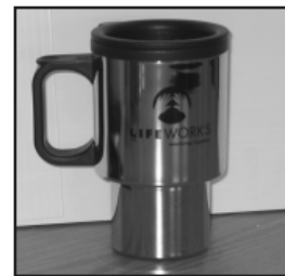
Mugs - $14